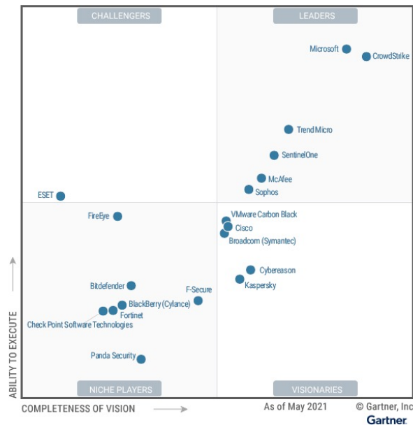
Figure 1: Magic Quadrant for Endpoint Protection Platforms